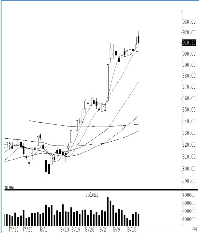
S50U24 (Close 910.30 Chg -5.50)